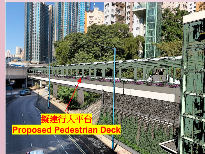
擬建行人平台 Proposed Pedestrian Deck

Contract No.: ED/2021/01 Elevated Landscaped Pedestrian Deck near MTR Kwun Tong Station